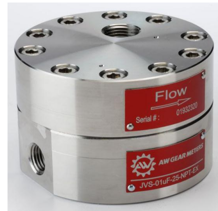
Figure 2: Flow meter with direction of flow marked with arrow

Flow direction is marked with an arrow on the flow meter. See Figure 2.